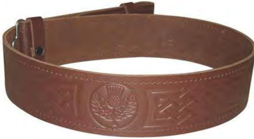
THISTLE BELT BROWN