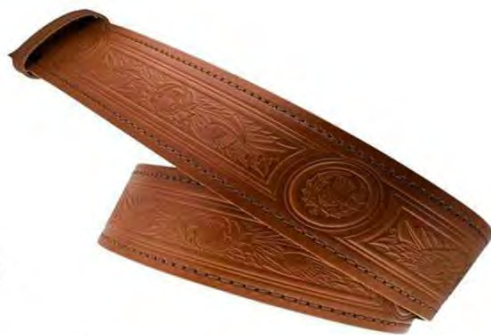
CELTIC BELT NO. 4