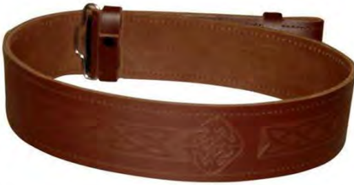
CELTIC BELT NO. 1