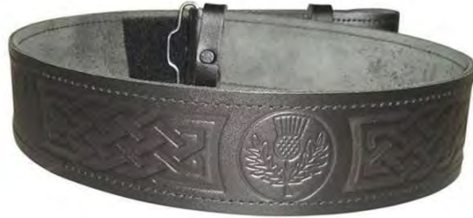
THISTLE BELT BLACK