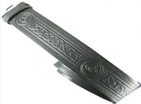
CELTIC BELT NO. 3