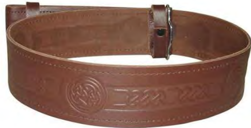
CELTIC BELT NO. 2